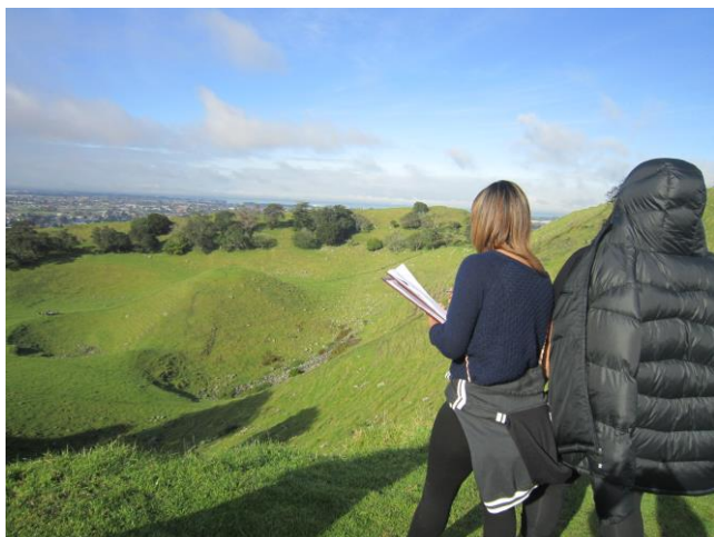
The value of the research in geography is the opportunity to see the links between what they learn in the classroom and what they observe in the field.

In geography 'primary data' is data that the students have collected themselves i.e. raw data from the 'field'. The list of examples from the standards covers 'observing, measuring, précis sketching, surveying, photographing, using questionnaires, interviewing'. It does not include