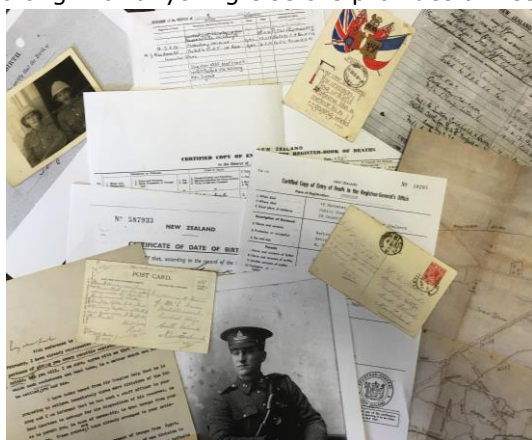
Engaging with these types of sources in class improves literacy skills, critical reading skills and thinking skills, along with providing students with a window to the past.

ears to try to gain a better understanding of something that affects people and place. While it is desirable that students are able to leave the classroom to undertake this research, this does not always have to be the case. Online surveys and visiting speakers are examples of classroom based primary research. In history, classical studies and social studies the reference to 'primary sources' refers to materials or artefacts that originate from the actual time or event being examined. Primary source materials relate directly to the topic by either time or participation, sources such as diary entries, letters, speeches, newspaper articles from the time, oral history interviews, documents and photographs are all included in this category, along with anything else that provides a first-hand account about a